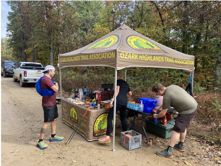
OHTA runners' aid station at Hare Mountain 100

For those of you who may be wondering why nothing was reported on the outcome of the Hare Mountain 100, the reason is simply that the reporter overlooked it. In hopes of remedying this oversight, here's what we've learned about it.