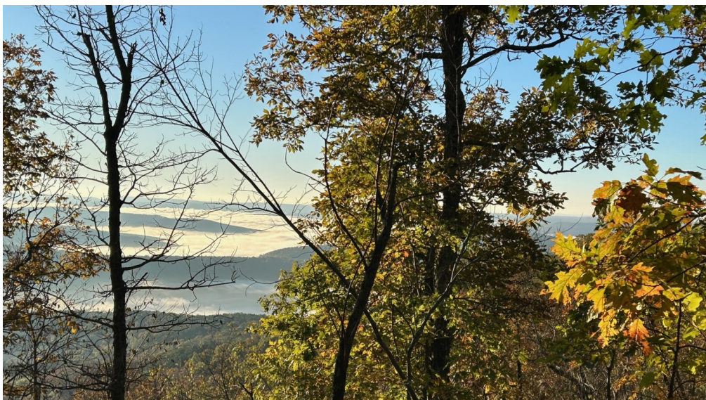
Photo from Hare Mountain

Keeping with tradition, the event will include a fantastic potluck meal in the late afternoon, a big bonfire to help warm your bones and your spirit, and plenty of wild stories. So, get your hiking legs on, your camping gear ready to pack, and prepare to summit Hare. There will be more details coming as the event draws nearer, so stay tuned!